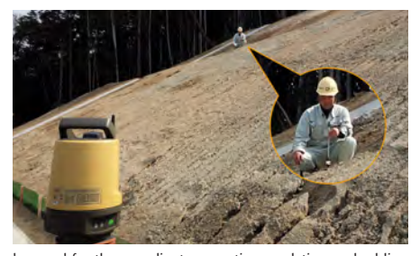
be used for the coordinates, creating, updating and adding data is so easy."

On the same theme of "simplicity," he mentioned that the TopLayout control software is easy to use, "It's simple to use and I was able to learn how it worked right away. It's so simple you ask yourself 'Is that it?' Because a CSV file can